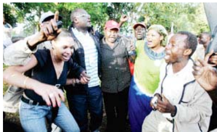
Kenyans celebrate Senator Barack Obama's win in the US presidential polls in Kogelo, Siaya District, on Wednesday.

In the tiny village off a dusty path from the main Kisumu-Siaya road, activity throbbed all night alongside the elections that would install its 'own son' into the White House.